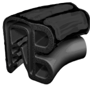
40.0732: Article cod for continuous profile (A 3213)