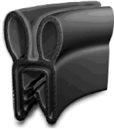
40.0731: Article cod for continuous profile (A 3208)