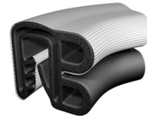
30.0061: Article cod for continuous profile (A 3213-L-E-SC)