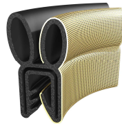
30.0019: Article cod for continuous profile (A 3208-E-SC)