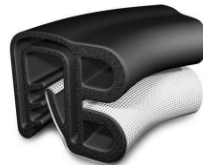
30.0058: Article cod for continuous profile (A 3213-E-SC)